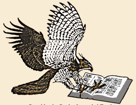
Stand by the Rock of revealed Truth. It makes the difference! Matt. 16:15-18

Our Website: www.bftchurch.org Mobile.: +234-7060406157, 09082709737.